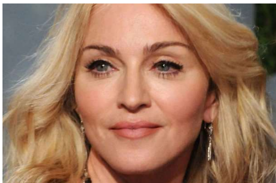
60 / American / singer