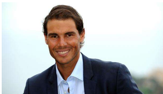
32 / Spanish / tennis player